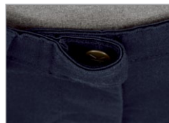
Covered Waistband Button