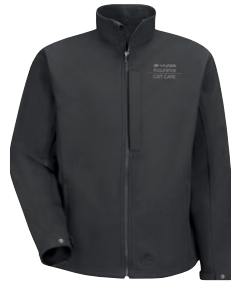
SOFT SHELL JACKET JP66BK COLOR: BLACK (BK)