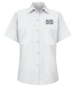
WOMEN'S INDUSTRIAL WORK SHIRT LONG SLEEVE: SP13WH / SHORT SLEEVE: SP23WH COLOR: WHITE (WH) / SP23WH SHOWN