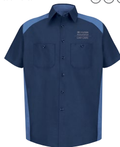
MOTORSPORTS SHIRT LONG SLEEVE: SP18NP / SHORT SLEEVE: SP28NP COLOR: NAVY / POSTMAN BLUE (NP) SP28NP SHOWN