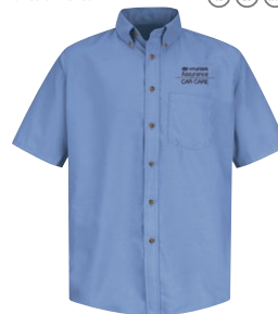
MEN'S POPLIN DRESS SHIRT LONG SLEEVE: SP90 / SHORT SLEEVE: SP80 COLOR: LIGHT BLUE (LB), WHITE (WH) SP80LB SHOWN