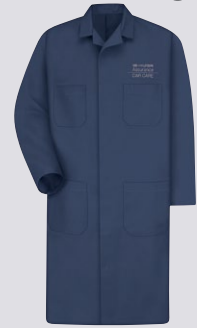
TECHNICIAN SHOP COAT KT30NV COLOR: NAVY (NV)