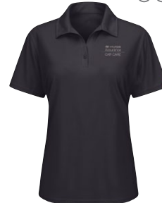
PERFORMANCE KNIT® FLEX SERIES WOMEN'S PRO POLO / SK91 COLOR: BLACK (BK), GREY (GY), WHITE (WH) SK91BK SHOWN