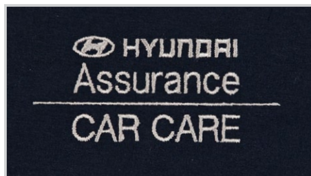
EL-LUF-ELS279 FOR JP66: EL-2W3-ELS279 Penguin Grey thread

Hyundai embroidery for LUF (left upper front) and CUB (center upper back)