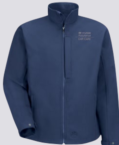
SOFT SHELL JACKET JP66NV COLOR: NAVY (NV)