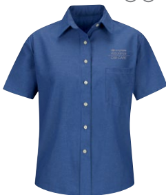
WOMEN'S OXFORD SHIRT LONG SLEEVE: SR75 / SHORT SLEEVE: SR65 COLOR: FRENCH BLUE (FB) SR65FB SHOWN