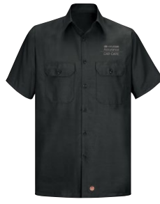
SOLID RIPSTOP SHIRT LONG SLEEVE: SY50 / SHORT SLEEVE: SY60 COLOR: BLACK (BK), LIGHT GREY (GY) SY60BK SHOWN