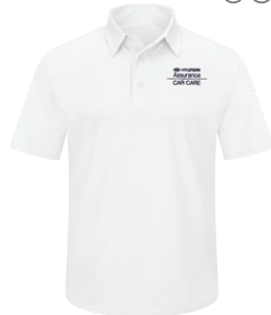
PERFORMANCE KNIT® FLEX SERIES MEN'S PRO POLO / SK90 COLOR: BLACK (BK), GREY (GY), WHITE (WH) SK90WH SHOWN