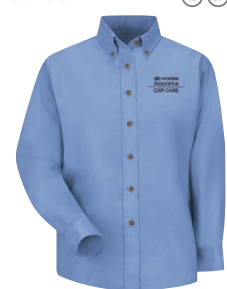
WOMEN'S POPLIN DRESS SHIRT LONG SLEEVE: SP91 / SHORT SLEEVE: SP81 COLOR: LIGHT BLUE (LB), WHITE (WH) SP91LB SHOWN