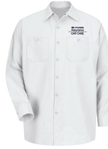
MEN'S INDUSTRIAL WORK SHIRT LONG SLEEVE: SP14WH / SHORT SLEEVE: SP24WH COLOR: WHITE (WH) / SP14WH SHOWN