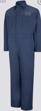
TECHNICIAN COVERALL CT10NV COLOR: NAVY (NV)