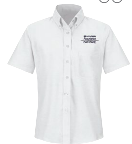
WOMEN'S EXECUTIVE OXFORD SHIRT LONG SLEEVE: SR71 / SHORT SLEEVE: SR61 COLOR: LIGHT BLUE (LB), WHITE (WH) SR61WH SHOWN