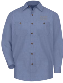
MICRO PLAID DRESS SHIRT LONG SLEEVE: SP14 / SHORT SLEEVE: SP24 COLOR: DENIM (DN), BLUE / CHARCOAL (GB) SP14DN SHOWN