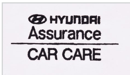
EL-LUF-ELV737 Black thread

Hyundai embroidery for LUF (left upper front) and CUB (center upper back)