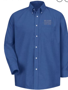
MEN'S EXECUTIVE OXFORD SHIRT LONG SLEEVE: SR70 / SHORT SLEEVE: SR60 COLOR: FRENCH BLUE (FB), WHITE (WH) SR70FB SHOWN